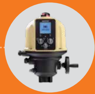
AQ5 - AQ10 - AQ15 - AQ25 - AQ30 - AQ50 - AQ80 - AQ100 AQ150 - AQ280 - AQ430 - AQ610 - AQ830 - AQ1000 LOGIC version