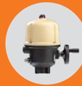
AQ5 - AQ10 - AQ15 - AQ25 - AQ30 - AQ50 - AQ80 - AQ100 AQ150 - AQ280 - AQ430 - AQ610 - AQ830 - AQ1000 SWITCH version